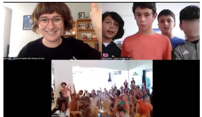
Online final between the French schools of Pretoria, Johannesburg and Cape Town on 15 March