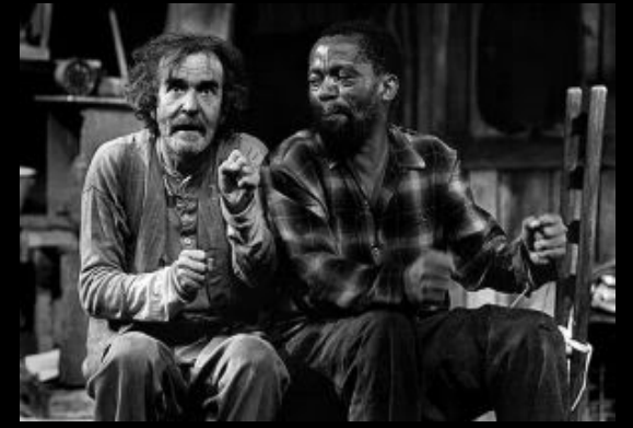
Athol Fugard (left) and Zakes Mokae (right) acting in The Blood Knot

1967 The government takes away Fugard's passport in response to the BBC broadcasting a performance of The Blood Knot , not to return it until 1971 so that he could fly to London to direct Boesman and Lena