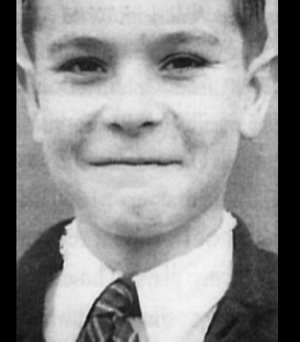
Young Fugard, photo from Falls the Shadow